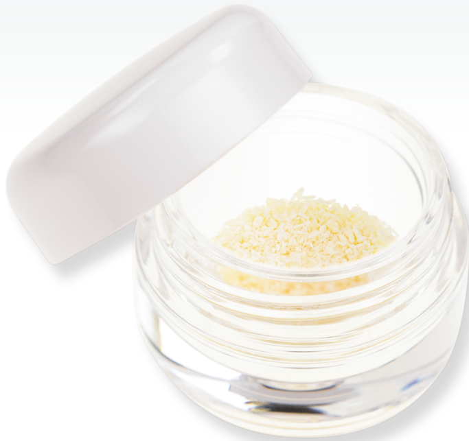
Puros® Ci Particulate Allograft