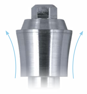
4.8 mm 4.8 mm 5.0 mm

The Low Profile Abutment's new contoured emergence profile provides easier placement in subcrestal and flapless surgery. The emergence starts off straight, then gently curves out to the restorative platform. This emergence mitigates the need for bone profiling prior to seating the abutments. Because the Low Profile Abutment has one restorative platform, there is no need to inventory multiple sizes of restorative components. Whether you are restoring a 3.4 mm or a 5.0 mm platform implant, the restorative components have the same seating diameter of 4.8 mm.