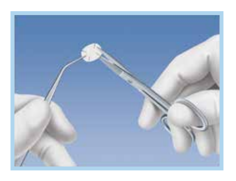
BioMend Membrane being prepared for placement in the sinus cavity

A rigid enough scaffold for tissue regeneration in GTR and GBR procedures