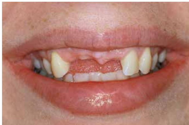
A patient with multiple missing teeth.