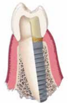
A dental implant and implant crown are designed to mimic the look, feel, and function of a natural tooth.