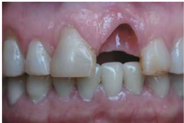
A single missing tooth.