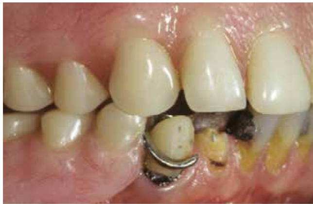
Removable partial dentures have metal hooks that wrap around existing teeth, which may compromise the health and appearance of those supporting teeth.