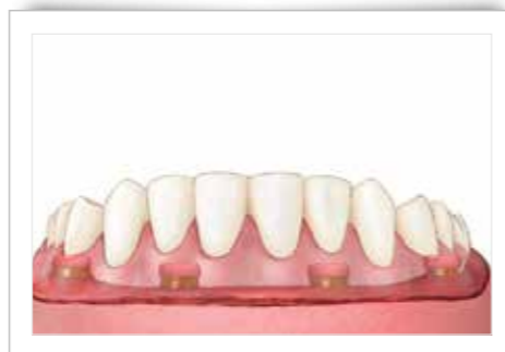
Your replacement teeth are secured in place on top of the foundation provided by the dental implants.