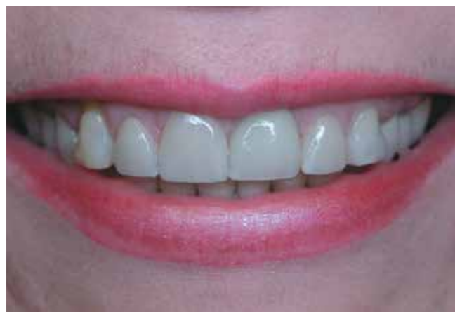
Implant crown in place on top of the foundation provided by the dental implant.