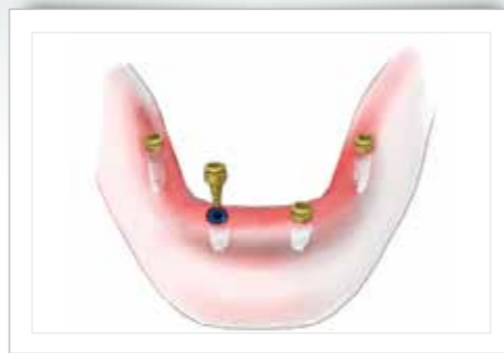
Abutments are placed on top of the dental implants.