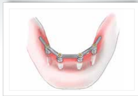
A custom support bar is secured to the dental implants.