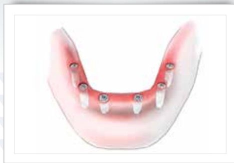
Dental implants are placed.