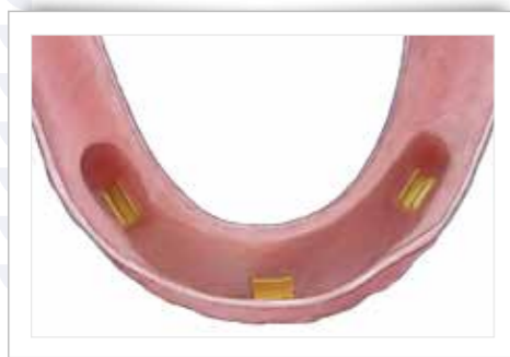
Clip attachments are placed in your replacement teeth.