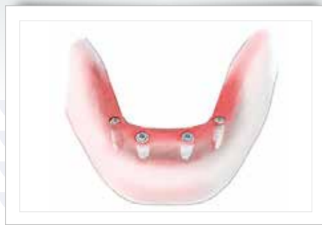
Dental implants are placed.

Teeth Replacement Therapy That Mimics Nature