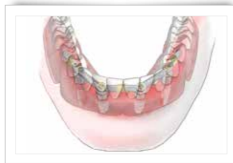
Your replacement teeth are secured in place on top of the foundation provided by the dental implants.