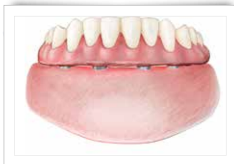
Your replacement teeth are secured in place on top of the foundation provided by the dental implants with fixation screws only accessible by your dentist.