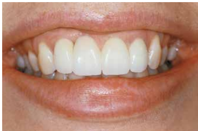
Restoration in place on top of the foundation provided by the dental implants.