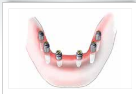
Abutments are placed on top of the dental implants.