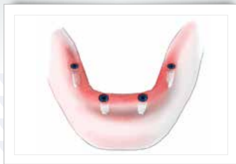
Dental implants are placed.