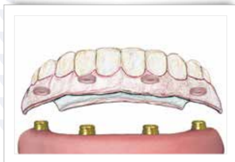
Attachments are placed in your replacement teeth that allow a snap-fit connection to the abutments.