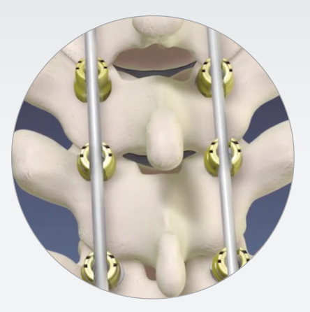
Aligned Screw Seats Same screws after misaligned screw seats have been translated into alignment.