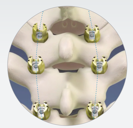
Misaligned Screw Seats Screws are placed in a preferred anatomic location, resulting in misaligned screw seats.

Medial/lateral screw translation allows for less rod manipulation and simplifies rod introduction. As a result, operating room efficiency may be increased.